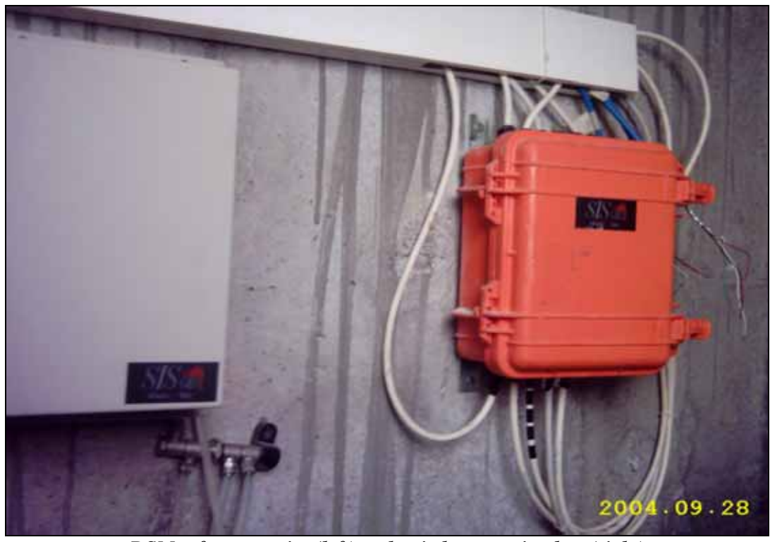
DSM reference point (left) and switch measuring box (right)