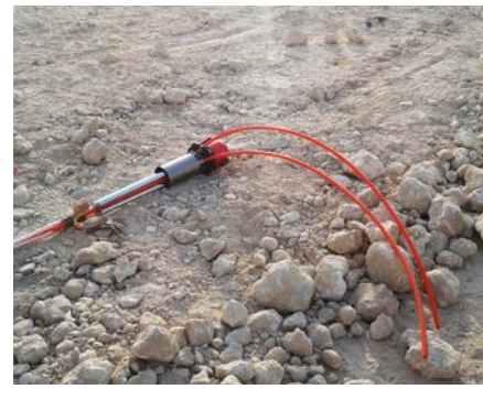
Sisgeo extensometer head ready for installation